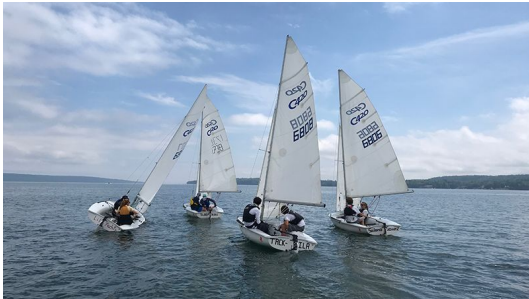
420 Race team pre-race