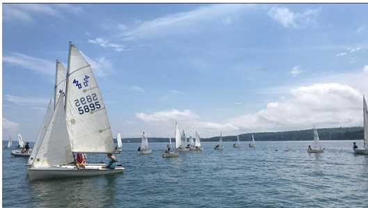
Light wind sailing