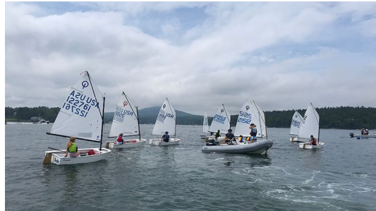
Optis lining up for the start